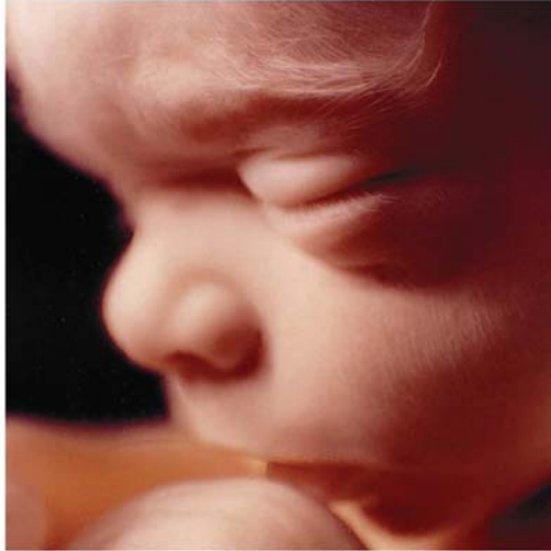
image of an unborn child at 5 months gestation