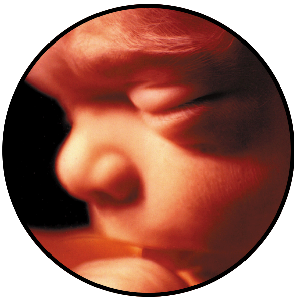
Baby in utero at 20 weeks