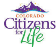
Colorado Citizens for Life