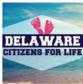
Delaware Citizens for Life