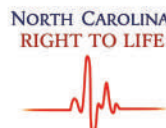
North Carolina Right to Life