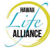
Hawaii Life Alliance