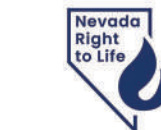
Nevada Right to Life